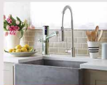
KempSmart i9U Undersink