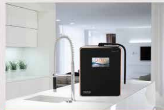
KempSmart i9 (Rose Black)

Size (WLH) : 150 x 270 x 370 mm Weight : 6Kg