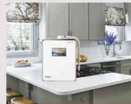
KempSmart i9 (Rose White)

Size (WLH) : 150 x 270 x 370 mm Weight : 6Kg